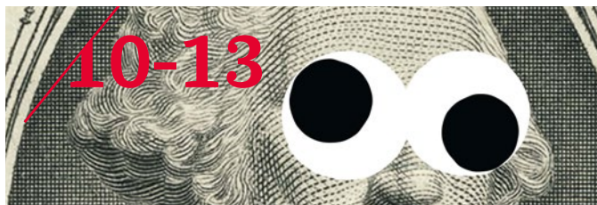
Stand Up Economics FEB Researchers on stage