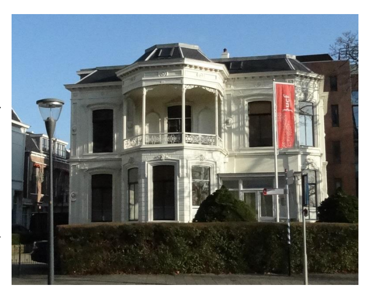
Current headquarters UCF and RUG/Campus Fryslân

A provisional schedule of requirements has been drawn up, based on the present development plan. Alongside financial constraints of course, the choice of location will be